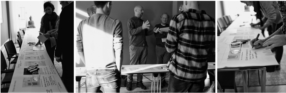
Figure 2. Participants creating a service scenario during a stakeholder workshop.