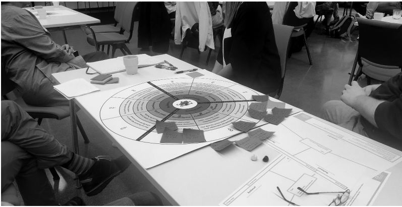
Figure 3. Transformation game in a stakeholder workshop.

the project, the catalogue was continually updated as the work in the ULL progressed and was used as background reading before workshops and referred to during workshops as a way to engage in the material. The second tool was the implementation of different types of transformation games (see Figure 3 ) which were different kinds of workshop methods that aided in making findings from the project more tangible, supporting critical thinking and perspective changes, while providing a playful way of interacting with key findings.